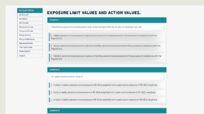
Final Exam – Certificates Provided.